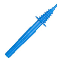
pin probe, blue 1 kV (banana socket) WASONBU0GB1