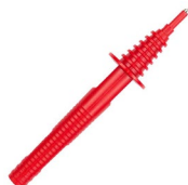
test probe with banana socket; 1 kV; red