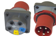
AGT-63P three-phase socket adapter 63 A WAADAAGT63P