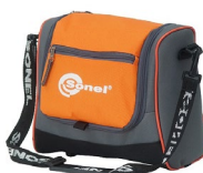
M-6 carrying case