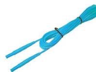
test lead 5 m, blue, 1 kV (banana plugs) WAPRZ005BUBB