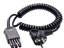
WS-04 adapter with UNI-SCHUKO angular plug WAADAWS04