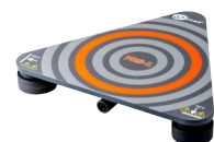
PRS-1 resistance test probe WASONPRS1GB