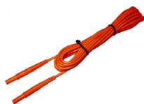
test lead 5 m, red, 1 kV (banana plugs) WAPRZ005REBB