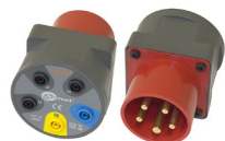
AGT-32P three-phase socket adapter 32 A WAADAAGT32P