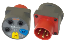
AGT-16P three-phase socket adapter 16 A WAADAAGT16P