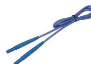
test lead with banana plugs; 1 kV; 1.2 m; blue