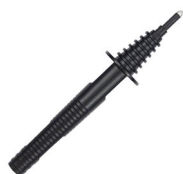
test probe with banana socket; 1 kV; black