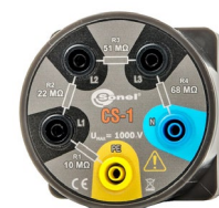
CS-1 cable simulator WAADACS1