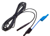
test lead 5 m, black, 1 kV (banana plugs, shielded) WAPRZ005BLBBE