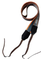
meter strap (type M-1)